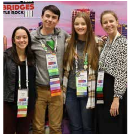
NAI's Young Professionals Council at NAI 2024 in Arkansas

NAI's professional development and education program underwent a restructuring in 2023–24. Under the new format, hundreds of interpreters earned certificates as interpretive guides, while 68 individuals earned the following professional certifications: Certified Interpretive Trainer (54), Certified Interpretive Planner (9), Certified Interpretive Manager (3), and Certified Heritage Interpreter (2).