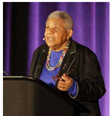
Conference keynote speaker Minnijean Brown Trickey